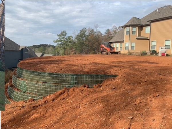
Soil Basket– Living Walls